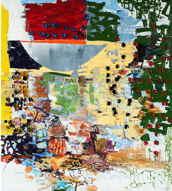
Countryside , 2021, Oil on canvas, 79 x 71 inches (200.7 x 180.3 cm)

High-res. photos are available upon request from Julie Kolka, Web/Marketing Manager, juliek@rosenbaumcontemporary.com , 561-994-4422 x136